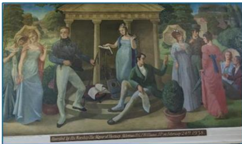
One of the 1938 murals installed upstairs

We will, before very long, need help to make all this happen and will be interested to hear from any who are interested in helping. Reach out by dropping an email to friends.muswell@gmail.com . If you cannot help, but want to stay up-to-date, drop us an email and we can add you to our Newsletter circulation list.