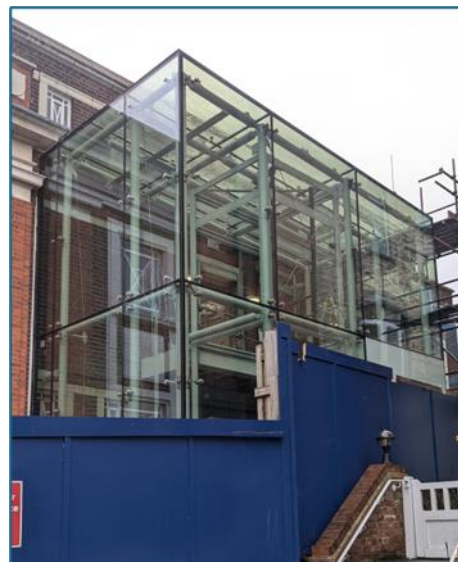
The new extension in Queens Avenue

The Friends of Muswell Hill Library has not been entirely inactive during the closure, despite the lack of an actual Library. Haringey, threatened by bankruptcy, proposed deep cuts to the opening hours of its libraries. We have successfully fought for fair treatment for our library which, because of its closure, was out-of-mind for a large part of the consultation period. As a result, the previous opening hours of 57/week are going to be cut to 41 hours/week, instead of the initially proposed total of just 29 hours/week.