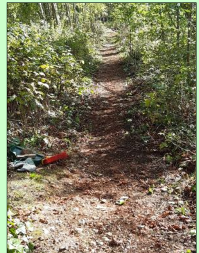
The path before clearance