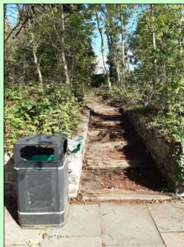
The path after clearance