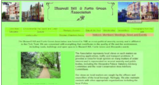
A very faded home page on the 2005 website www.mhfga.1and1.org

Launched in 2002, the website of the Muswell Hill & Fortis Green Association was introduced to complement the traditional Newsletter in communicating with our local and not-so-local community. At the time there were fewer than 40 million websites online, and the then www.muswellhillandfortisgreenassociation.co.uk (yes, that was the first address) was a runaway success, its 12 pages seen in its first year by 34,000 visitors, 1,000 from overseas.