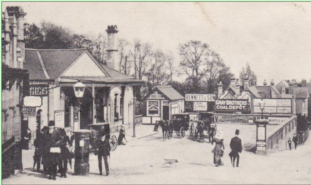
Muswell Hill Old Train Station

Once upon a time you could travel by train from Alexandra Palace via Muswell Hill and Cranley Gardens to Finsbury Park. And for a moment it looked like the network could become part of the tube and expanded to the north to Bushey Heath and High Barnet, and south to Moorgate. Instead, on the 3 rd July 1954, after 81 years of service, despite representations by a formidable list of local organisations (the Middlesex County Council; Finchley, Hornsey, Islington and Wood Green Borough Councils; Friern Barnet Urban District Council; the Alexandra Park Trustees; Hornsey Chamber of Commerce; and the Federation of Ratepayers' and Kindred Associations in Middlesex) the line was closed down.