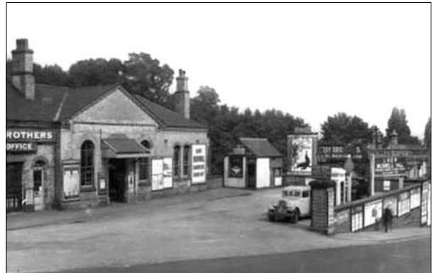
Muswell Hill Station entrance, c.1930s, from the Disused Stations website

The steam trains were running between 8.00am and 9.00am, no less than 7 trains, and between 9.00am and 10.00am the number was 5. These were between Muswell Hill and Finsbury Park. All these trains served Alexandra Park, Cranley Gardens and Highgate. There was also a facility which I think was unique on any line entering London. This was at Finsbury Park. At this station trains came from the Barnet and Alexandra Palace lines, the Enfield line and the Main line local service from Potters Bar.