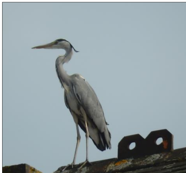
Spotted on a rooftop in Queens's Avenue!