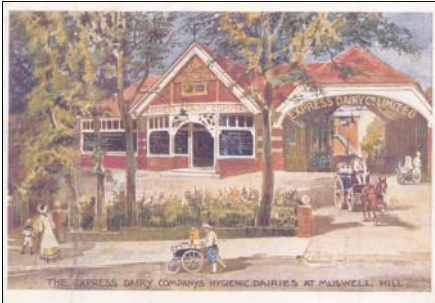
The old Express Dairy

"I can remember the lipid stillness of the Muswell, and the knolls where the cowslip and the violet grew under the oaks, in the region now covered by the Alexandra Palace and its grounds. We would wander there all day and meet no-one but a carter and a milkmaid". So wrote Frederick Harrison the philosopher and critic who lived a Belle Vue until 1840: his villa was demolished in 1900. Buses and lorries roar up the hill past the Express Dairy which stands on the site: there may be a milkmaid around, but she will be serving coffee.