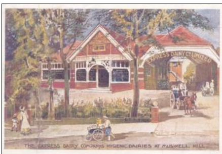
The old Express Dairy

"I can remember the lipid stillness of the Muswell, and the knolls where the cowslip and the violet grew under the oaks, in the region now covered by the Alexandra Palace and its grounds. We would wander there all day and meet no-one but a carter and a milkmaid". So wrote Frederick Harrison the philosopher and critic who lived a Belle Vue until 1840: his villa was demolished in 1900. Buses and lorries roar up the hill past the Express Dairy which stands on the site: there may be a milkmaid around, but she will be serving coffee.