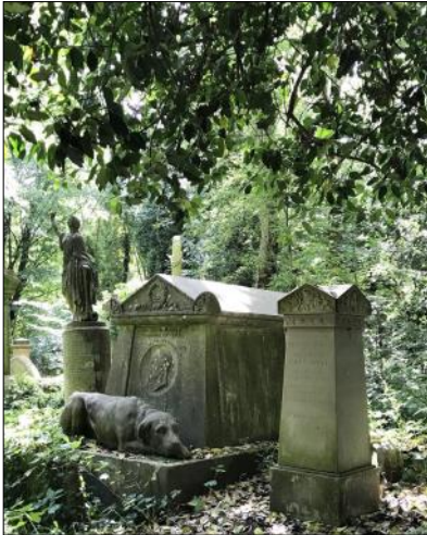
The tomb of Tom Sayers, the Victorian pugilist, guarded by the stone image of his mastiff, Lion, who was chief mourner at his funeral.