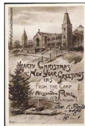
Christmas card from the refugee camp 1914

Although nothing happened at the Palace during several decades, events throughout its history have ensured that many people regard Alexandra Palace with great affection. The launch of broadcast television in 1936 from the iconic East Wing is just one landmark in the timeline – and broadcast history has become another specialist area of collecting.