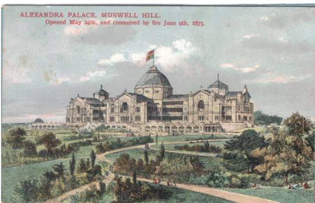
The first palace 1873

Many of the collectibles are souvenirs of the Palace from the early days, such as photo albums, plates, letter openers and boxes. Flyers and programmes of concerts, from Gounod's Faust in 1908 to Barry Manilow in 1988 and Blur in 1994, bring the collection more up to date, while race cards and images of the racecourse (nicknamed the Frying Pan for its shape) remind many of the popular facility that closed in 1970. Large corporate and consumer exhibitions have always provided a rich source of memorabilia too.