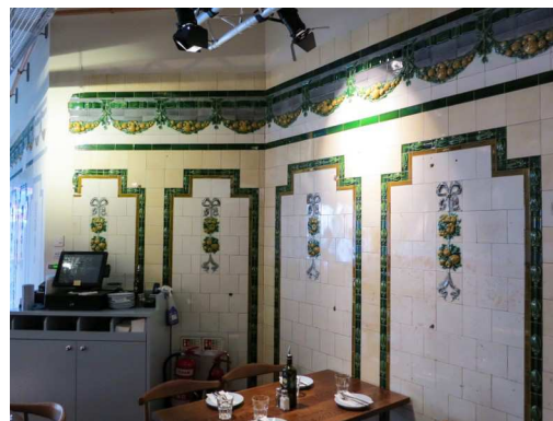
The Real Greek