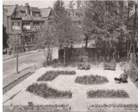
The site became a garden before the pub was built