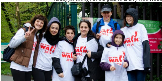
Ready for the off, at the gate to Cherry Tree Wood

Big Fun Walk is back again in 2015, on Sunday 22 March. Don't miss the opportunity to be a part the biggest fundraising event in the calendar. Walk eight-and-a-half miles through London's beautiful parks, enjoy a complimentary lunch in Regents Park and finish with tea and cake in Storeys Gate, Westminster. Register before the end of January 2015 for £10 instead of £15. For more information and to register, go to: http://www.bigfunwalk.co.uk/ .