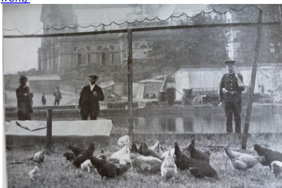
Armed guards and chickens at Ally Pally POW camp 1915

War on The Home Front is a fascinating exhibition of local collectibles and stories, with a short video, on the role the Palace played in the 1914-1918 war. Tickets £1.00. www.alexandrapalace.com/whats-on/war-on-the-home-front/