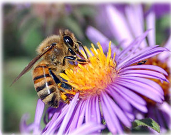
European honey bee extracting nectar

Join us at North Bank Methodist Church in Pages Lane, Muswell Hill at 7.30 p.m. on Wednesday 19 March. Parking is not a problem.