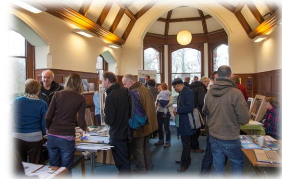
Visitors at last year's 21 st Century Homes Character Comfort Low Carbon event.

Thinking of improving your home? Don't miss Muswell Hill Sustainability Group's weekend Conference and Exhibition: Saturday 15 March 1.30 p.m. – 5 p.m. at Hornsey Moravian Church, Priory Road N8 7HR. House tours Sunday 16 March (book online). Book Online at http://mhsgroup.org/register-for-the-event/