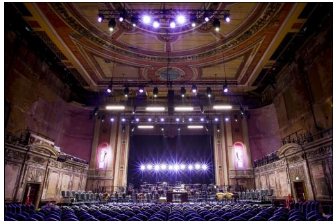
The theatre set up for BBC Proms open rehearsal on 1 st September

Tickets are on sale for the first season of shows this December which includes singing, comedy, and of course a family pantomime. Visit theatre.alexandrapalace.com to find out more. If you wrote your name into the history of the project by donating £25 or more you will soon be able to see your name on the donor board, and for those who donated £100 or more an exclusive preview tour will be happening in late November.