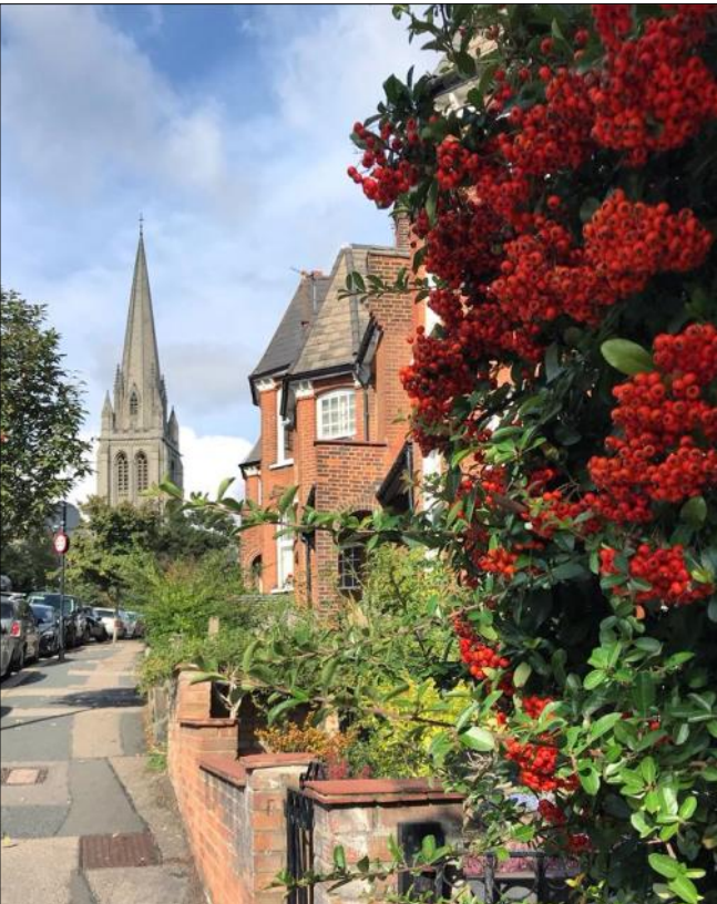
St James's Lane