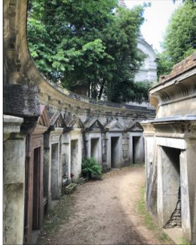
The Circle of Lebanon, a magnificent structure of twenty sunken tombs built around the roots of an ageing and ancient Cedar of Lebanon tree, from which the Circle gets its name.