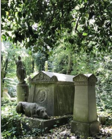
The tomb of Tom Sayers, the Victorian pugilist, guarded by the stone image of his mastiff, Lion, who was chief mourner at his funeral.